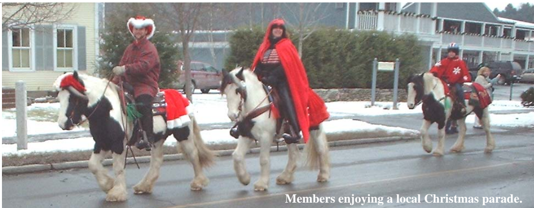
Members enjoying a local Christmas parade.

Happy Holidays! And Don't Forget to Watch the Rose Parade on January 1st to See Gypsy Cobs!