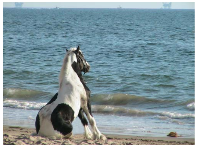
Gypsy lad gazes to sea, dreaming of stardom and stallionhood!