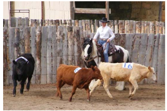
Paonia, CO; owner and manager of Edoras Stables, LLC www.edoras-stables.com Here is a link to the pictures from the event.

roping talent also (even though we had never actually practiced with a real cow) and almost caught the cow on the first throw! Had his rider been a better roper, we probably would have caught, as it was no fault of Ziggy's. The Ranch Trail and Pleasure Riding classes went really well also, and the judge had many good things to say about him. In fact, the day was filled with people com-