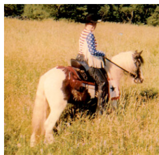
← Enchanted Kearney ↓