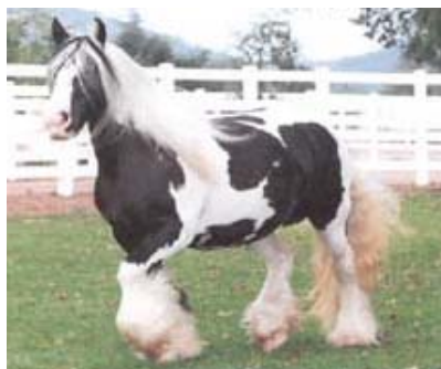
→ Windy Hill Ranch's Miss Wiggs