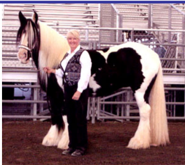
← Windy Hill Ranch's Miss Wiggs