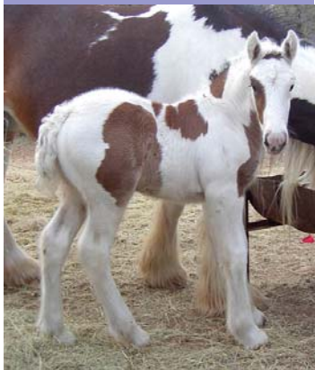
Gypsy Cob Foals are popping out all over!