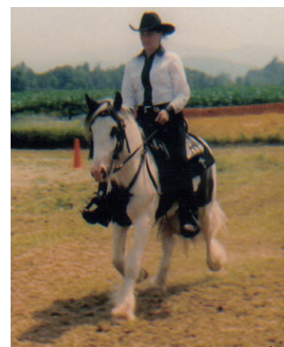
↑ Enchanted Kearney ↓